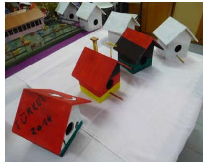
some products of the carpenters

In August/September 2014, 10 cooks and waiters went to France for 3 weeks, and in October/November, 7 construction workers and gardeners worked for 4 weeks on the ancient olive mill of the Spanish partner Mosaic in Can Oliveras/Catalunya . In addition, all participants completed internships in a garden and home improvement store near Besalú/Catalunya .