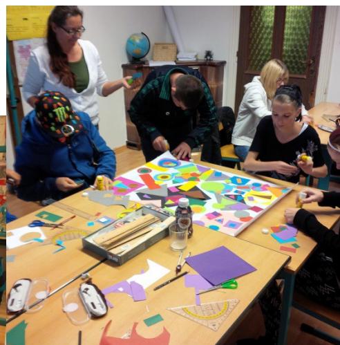
AusbildungsFIT: participants at the "knowledge garage" and art group-project

ÖJAB is involved in the ELLA project with the work-packages TRAINEE (please look at ELLA-Newsletter) and Quality-Management. More projects of ÖJAB can be found at: www.oejab.at/