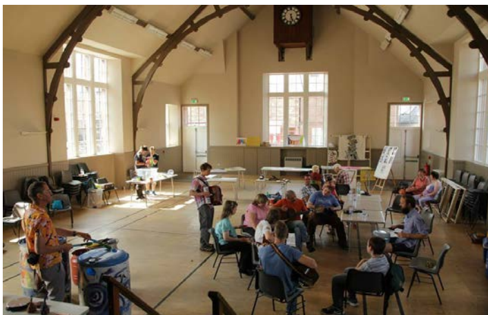
The participants of eXproviSing jamming