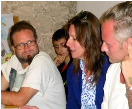
participants of the workshop in action

For more information, please look at http://www.ella-ella.eu