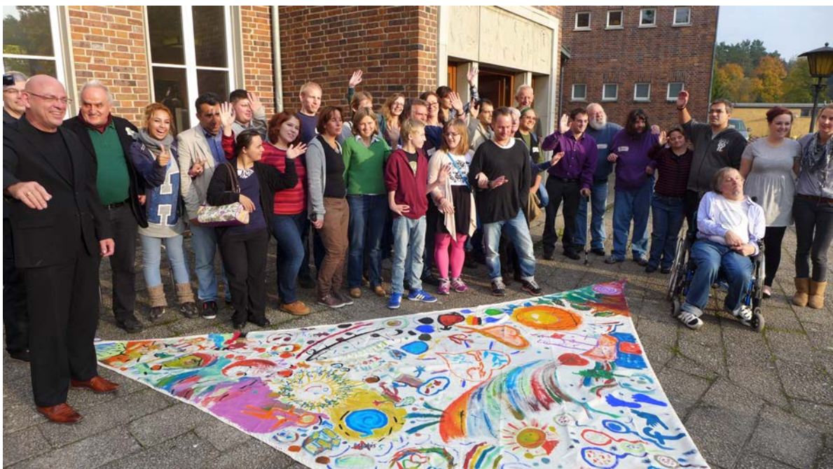
The participants with the Caravan Canvas, which they have designed together

Since Febr. 2013 IB Brandenburg is actively involved in setting up a centre for people with disabilities and their families in Tadzhikistan . The project is funded by the European Programme