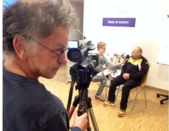
practicing the Interviews

Poland: Lead and managed by the Polish partner PSOUU , another partner-meeting of the inclusive, transgenerational music-project eXproviSing took place in Scotland . The event was hosted by the Scottish partner TRASH ART .